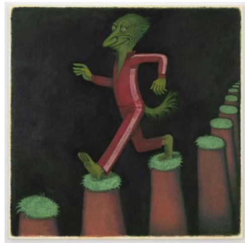
Clayton Schiff, Onward , 2020, Oil on canvas, 40" H x 40" W

CS: Yes, like the green devilish figure, sporting a red tracksuit in the painting, Onward . He's shown strutting confidently through a void, probably gifted with the grace of someone who's happy or oblivious enough not to consider death or danger. It's that similar kind of incongruity between circumstance and state of mind that seems to give the characters a kind of power.