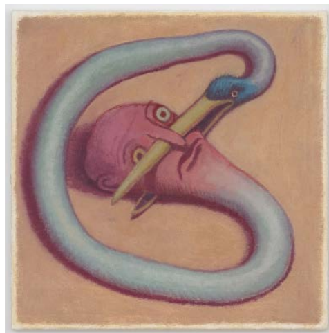
Clayton Schiff, Mix-up , 2021, Oil on canvas, 22" H x 22" W

CS: Yes, two subjects I'm generally dealing with are the body and the city. In the case of the body the limits seem to come from within. They're tightly packed into the frame of the canvas, an external constraint meant to link up with or highlight those limits. In the case of the city it usually diminishes their figures and presents them as a thing-among-things. The difference in either case might just be degrees of zoom—they both seem to be landscapes with a bigger structure containing smaller constituent parts that are straining to fill it.