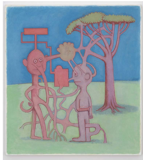
Clayton Schiff, Connectivity , 2018, Oil on canvas, 40" H x 36" W

JM: I love how you ride the line of optimism and pessimism. Some of your figures are just so plainly optimistic to me, but also some figures look like they're really, just going through it, you know? Even that seems sort of optimistic to me though. The two guys who are forming an intersubjective tube system with the tree- these seem like gestures towards "wellness".